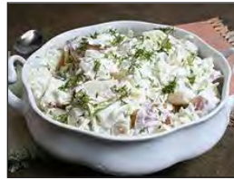
Redskin Potato Salad $20.00 Serves 10