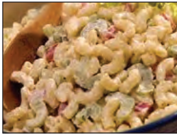
Macaroni Salad $20.00 Serves 10