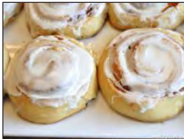
Cinnamon Cream Roll $36.00 Serves 12