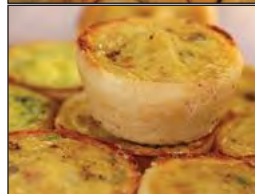
Miniature Quiche $49.50/Serves 10 Fresh egg, cheese and cream baked in a pastry crust.