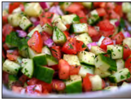
Israel Salad $20.00 Serves 10