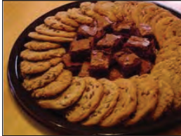
The BBC $2.95/Guest Brownie, blondes and an assortment of cookies on a platter.

12 Guests Minimum. All cakes serve 12-15 people. 48 hour notice required for cakes.