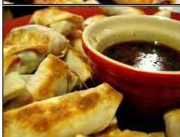
Mini Egg Rolls $29.50/Serves 10 Mini pork and vegetable egg roll.