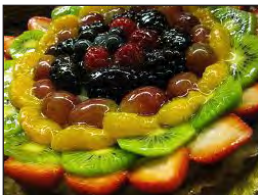
Fruit Tart $39.00 Serves 12-15