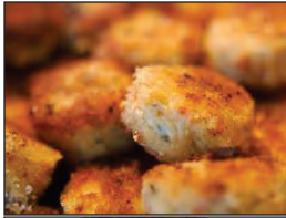
Mini Crab Cakes $59.50/Serves 10 Bite-size homemade crab cakes with Café X press original sauce.