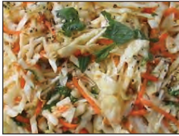
Coleslaw $15.00 Serves 10