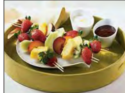
Fruit Kabobs $29.50/Serves 10 Skewers of the freshest seasonal fruits served with yogurt dip.