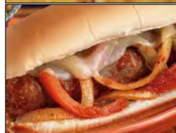
Italian Sausage $49.50/Serves 10 Grilled Italian sausage served hot with red peppers and onions accompanied by a cocktail roll.