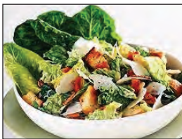
Caesar Salad $32.00 Serves 10