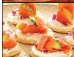
Smoked Salmon & Cream Cheese & Crackers $69.50 Serves 10 Nova salmon, cream cheese with an assortment of crackers.