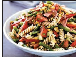
Pasta Salad with Vegetable $30.00 Serves 10