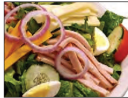
Tossed Salad $32.00 Serves 10