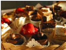
The French Quarter $60.00/Serves 12 A variety of French pastries.