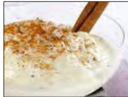
Rice Pudding $39.00 Serves 12-15