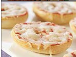
Mini Pizza Bagels $29.50/Serves 10 An assortment of topping with marinara sauce and melted mozzarella sauce.