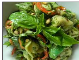
Cheese Tortellini Salad $30.00 Serves 10