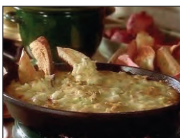
Warm Crab Meat $9.95/Guest Rich and creamy filled with crab.

Served with an assortment of thin breadsticks or bagels. 20 Guests Minimum.