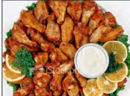
Buffalo Chicken Wings $39.50/Serves 10 Hot and spicy chicken wings with celery sticks and blue cheese dressing.