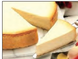
New York Cheese Cake $39.00/Serves 12-15