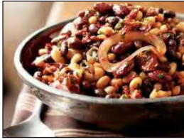
Bean Salad $20.00 Serves 10