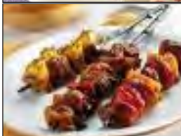
Mini Chicken Kabobs $39.50/Serves 10 Marinated chicken breast on wooden skewers.