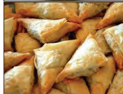
Spanikopita $39.50/Serves 10 Fresh spinach and feta cheese wrapped in triangles of flaky filo dough.