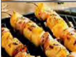
Grilled Ginger Chicken breast Pineapple Skewers $49.50 Serves 10 Marinated ginger chicken breast with fresh pineapple on wooden skewers.