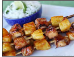
Mini Teriyaki Chicken Skewers $39.50 Serves 10 Teriyaki chicken breast on wooden skewers.