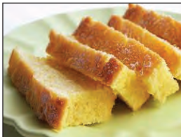
Pound Cake $28.00 Serves 12