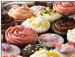
Cup Cakes (Chocolate, Vanilla, Lemon) $36.00 Serves 12