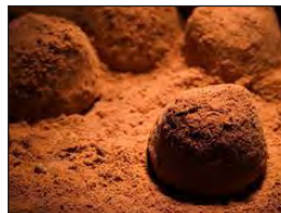
Assorted Chocolate Truffles $36.00 Serves 12