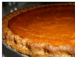
Sweet Potato Pie $36.00 Serves 12