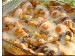
Creamy Bread Pudding $39.00/Serves 12-15