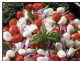
Fresh Mozzarella & Tomato $39.00 Serves 10