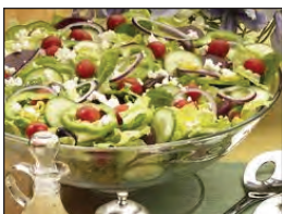
Greek Salad $39.00 Serves 10