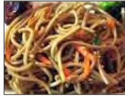
Oriental Noodle $20.00 Serves 10